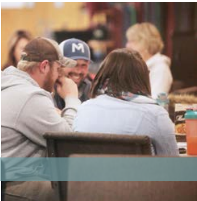
Snapshots from our Fall 2019 Pilot Groups